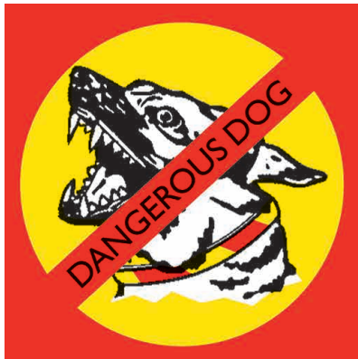
Figure 2. Example of a warning sign