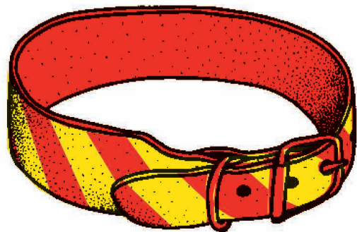
Figure 1. Example of a Declared Dangerous Dog collar